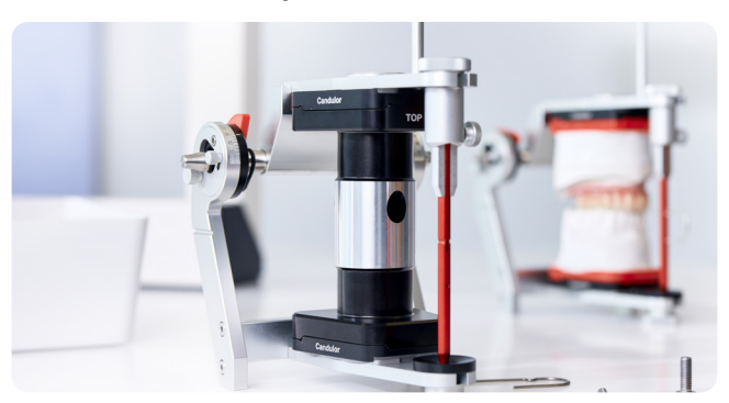
The articulators are perfectly calibrated