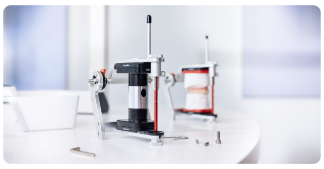
Easier working due to the integrated Split-Cast system.

Precise positioning and orientation aid with integrated guide groove so that the rubber band, incisal pointer and occlusal plane are at the same level.