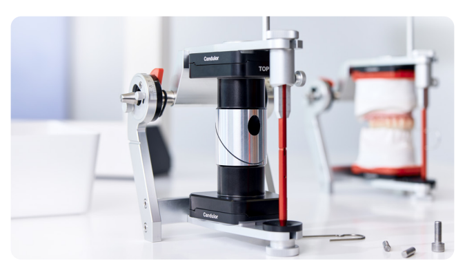
Inaccuracies in adjustment are easily visualized with the split centering key