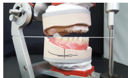
Figure 4 + 5 Alveolar ridge contour, lower first molar positions and stop line