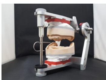
Figure 2 + 3 Initial situation for upper jaw hybrid denture and lower jaw full denture