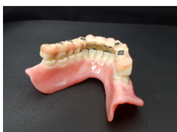
Figure 1 Lingualized occlusion, tooth-to-tooth

Systematic tooth-to-tooth loading with a transfer of the occlusal force towards the alveolar process with no destabilizing effective A contacts minimizes horizontal movements on the implant or abutment tooth. From our perspective, this is undoubtedly a far-sighted solution, as though Gerber anticipated today's hybrid prosthesis 40 years ago. The patient case presented here shows how modern and advantageous this occlusion concept actually is.