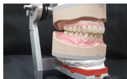
Figure 8 Tooth-to-tooth relationship for secure implant loading

The mortar and pestle principle developed by Gerber for lingualized occlusion is systematically and contemporarily implemented physically by Condyliform® II NFC+. Every posterior tooth is autonomously occlusally stable with BC contacts and A or buccal contacts are avoided thanks to lower buccal wear facets. In this way, forces are systematically directed towards the implant axis or the alveolar ridge. The tooth-to-tooth bulge/hollow or pestle/mortar principle avoids hyperbalance resulting from exclusive support by the upper load-bearing palatal cusps by creating moderate micro joint heads that find their static and dynamic counterpart in coordinated lower micro joint sockets. Associated with this is a self-locating centric contact based on its bulge/hollow geometry. For the first premolars the bulge/pestle and hollow/mortar principle is reversed because, based on findings by Gerber, it relieves the condyle and disk as an anterior ball joint.