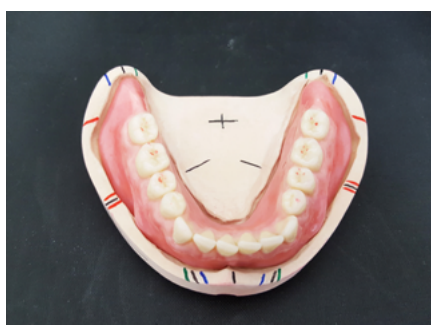
Figure 6 Narrow corridor for the centric stop, BC contacts – the first premolars have buccal cusp contact as defined by Gerber.

After the loading areas have been determined in each jaw, the occlusal bilateral buccal corridor is then determined. The aim is to place the static contact areas in the interalveolar alignment and thus obtain a secure bony abutment for the occlusal force absorption. Buccal or oral contact areas on the other side of these lines have a destabilizing effect on dentures as well as on implants or abutment teeth. The BC contacts associated with the lingualization subsequently create a narrow contact corridor. ABC contacts are broader transversally, A contacts in particular on one jaw side are not uncommonly outside the interalveolar bony abutment line. For this step the model placed in the articulator is considered from the dorsal aspect.