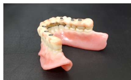
Figure 9 Condyliform® II NFC+ for the Gerber concept (not just) for hybrid dentures